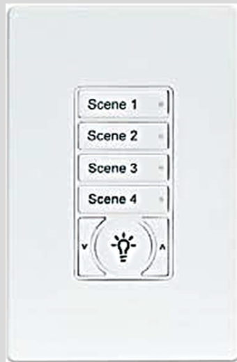
SCENE CONTROL WALL SMARTSWITCH